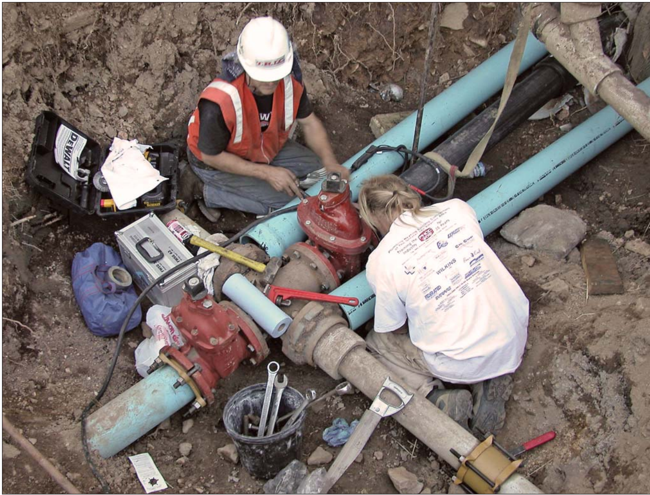
Above, the electrofusion coupling process is used to join the final joint and connect the new pipe to the valve assembly. Below, detaching the bursting head in the middle pit.