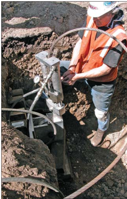
Worn grippers require assistance for entire pull.