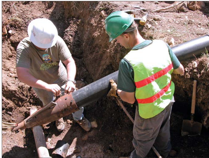
Final adjustments are made to the pipe attachment.