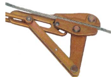
Cable shown attached to cable grip #K1684-5