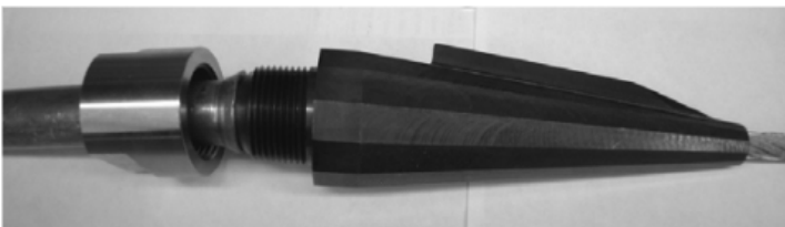
“The Wedge SE” shown ready to install copper pipe using the compression connector provided by Footage.